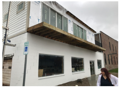
Beanblossom Building Phase Two Underway