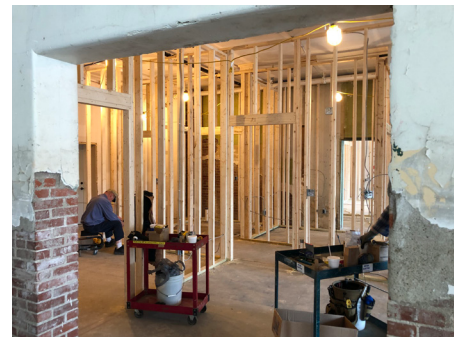
J.J. Bulleit Building Progress