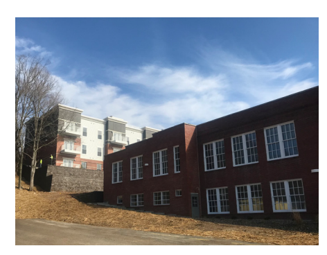
Corydon School Senior Lofts Construction Progress