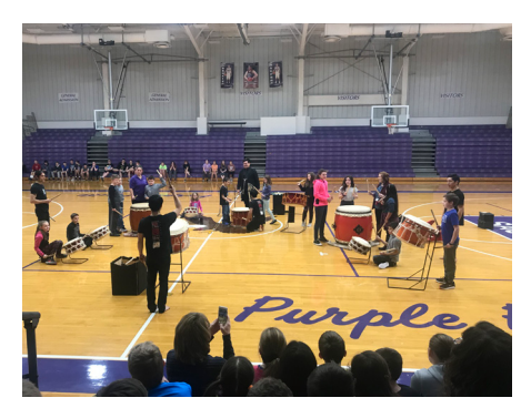
Ondekoza - Arts Midwest World Fest & The Indiana Arts Commission