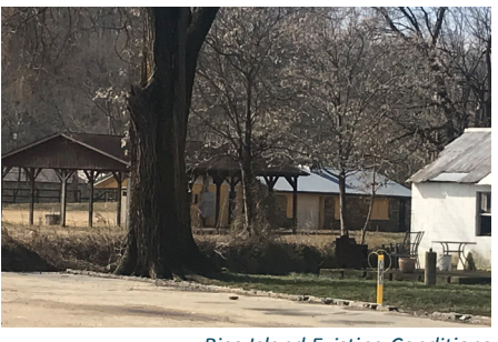
Rice Island Existing Conditions