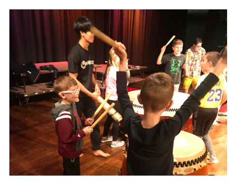
Ondekoza - Arts Midwest World Fest & The Indiana Arts Commission