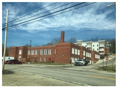
Corydon School Senior Lofts Construction Progress