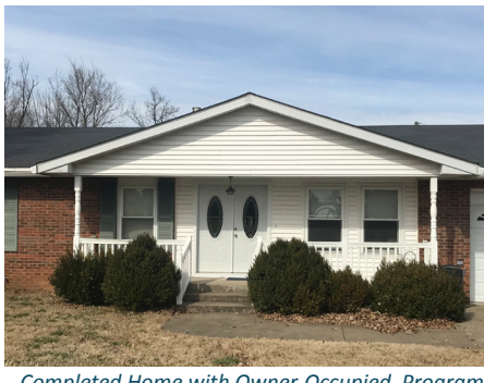
Completed Home with Owner-Occupied Program