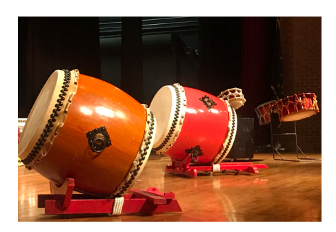
Ondekoza - Arts Midwest World Fest & The Indiana Arts Commission