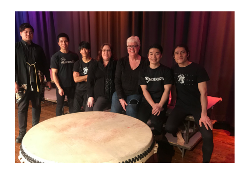
Ondekoza - Arts Midwest World Fest & The Indiana Arts Commission