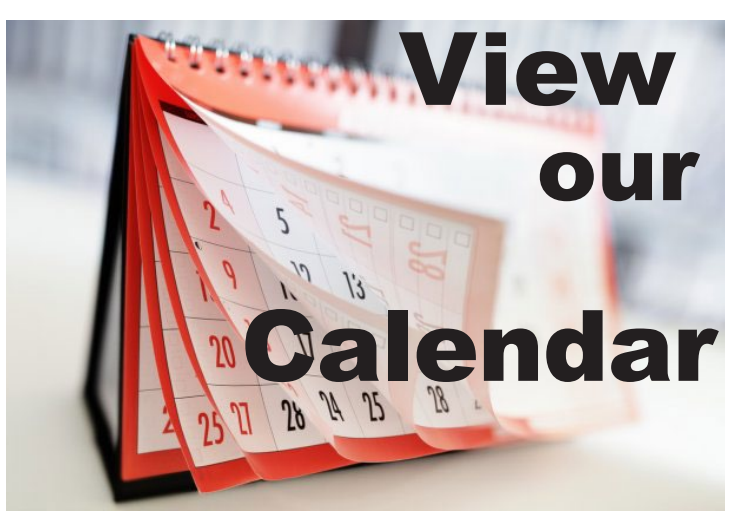
The complete 2018 calendar is available on our website. View it now!