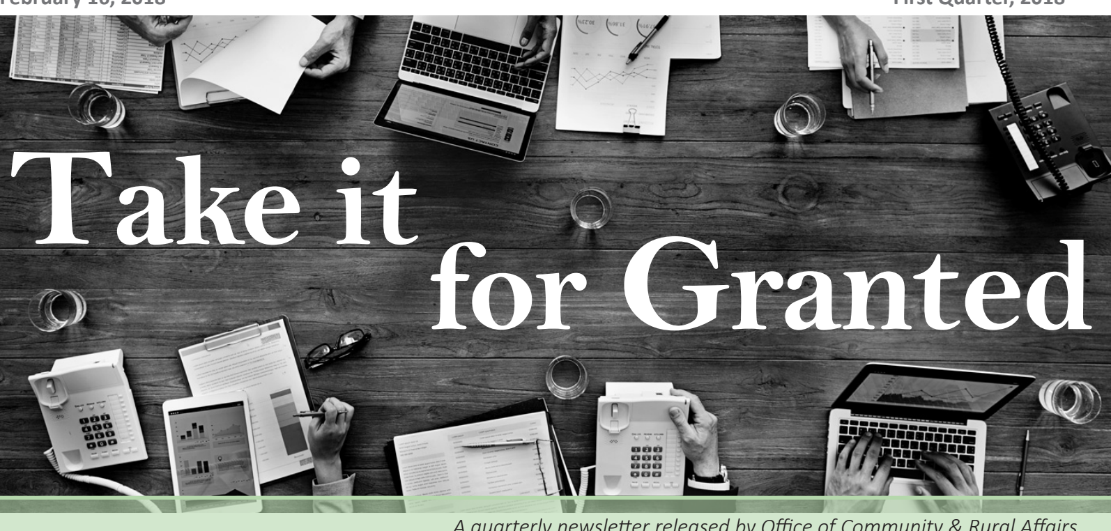
A quarterly newsletter released by Office of Community & Rural Affairs