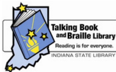
Click the image to visit the ISL Talking Book and Braille Library page