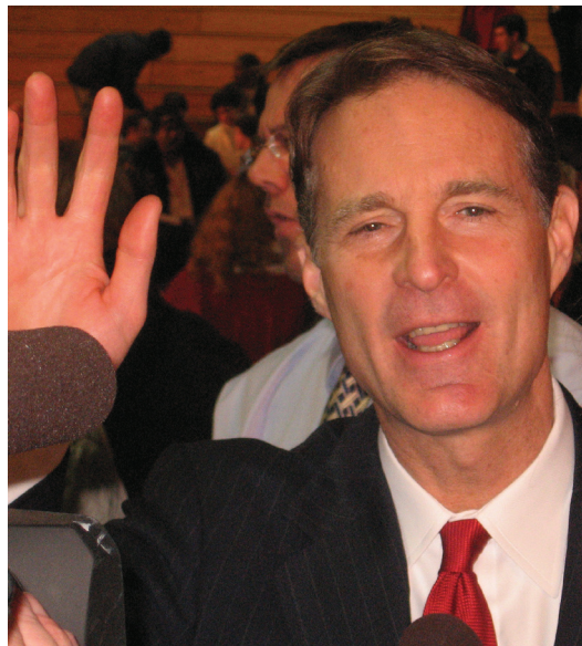
It's been a good week politically for Sen. Evan Bayh. He posted a $12.7 million FEC total and his top opponent took a pass on the race.