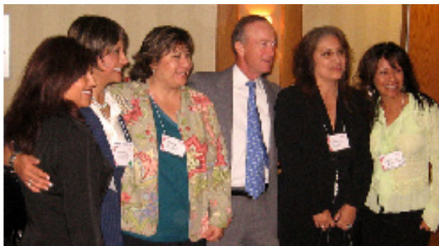
Gov. Mitch Daniels with members of the Indiana Commission on Hispanic/Latino Affairs at the Sheraton at Keystone in Indianapolis on Tuesday.