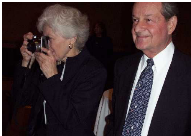
Former First Lady Judy O'Bannon has endorsed U.S. Sen. Hillary Clinton. She and Gov. Frank O'Bannon are shown on Election Night 2002.