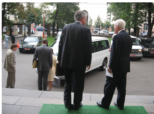
Sen. Lugar with U.S. Ambassador Burns outside the Rosatom Agency in Moscow last August. The 2007 Nobel Peace Prize will be announced Friday

"I will continue to support legislation that lays the groundwork for international peace and prosperity. Again, thank you for writing."