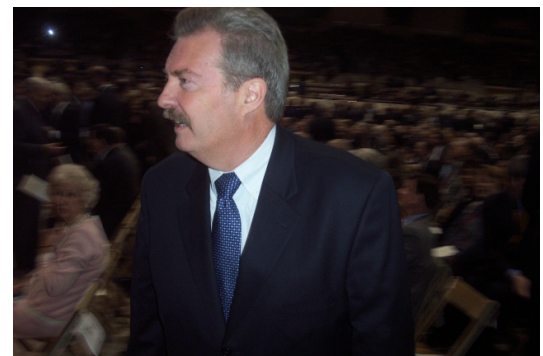
Hill-Sodrel: From page 1