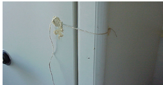
This string through wax was the security on a refrigerator containing biological agents.

Politkovskaya writes, "An atomic reactor with nuclear missiles is an explosive mixture. The submarine is packed with nuclear weapons, the economy is in crisis and the armed forces are in a state of disarray. What could be more scary than that?" As Vice Admiral Dorigin tells the journalist, "With things the way they are, it is only too easy to draw a man into illegal activity. I myself have been offered $2,000 in an enve-