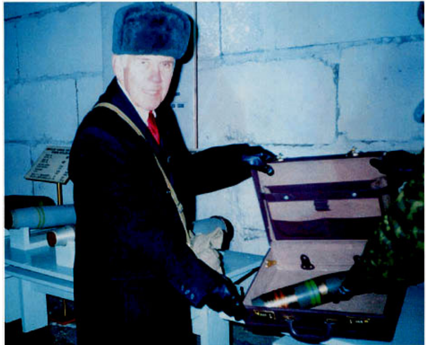
During a visit to the chemical weapons depository at Shchuchye, Russia in December 2000, Senator Lugar demonstrates the proliferation risk by placing an 85mm chemical shell into an ordinary briefcase. More than 1.9 million chemical munitions are housed at Shchuchye.