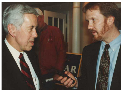
Sen. Lugar with HPR's Brian Howey in New Hampshire 1996.

If need be, scratch Lugar's name and insert Nunn's in the last five paragraphs. ❖