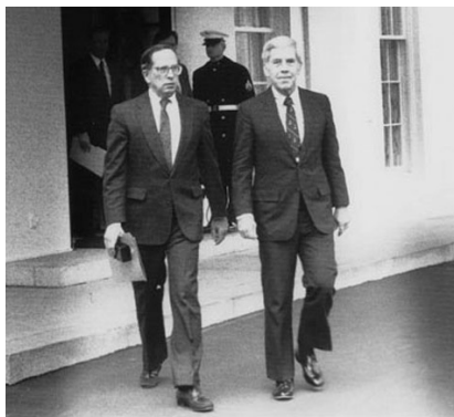
Nunn and Lugar leave the White House in 1991.

He talked of a consumption tax that would make the IRS obsolete and provide for higher wages with 4 percent growth. He tried to reform the agricul-