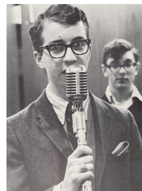
That's not Buddy Holly ... it's NCHS grad Mitch Daniels circa 1967.