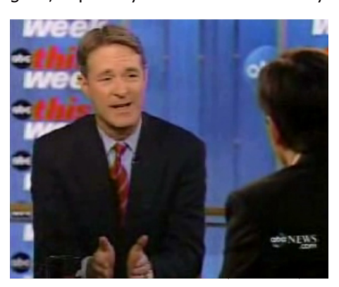
Sen. Bayh with ABC's George Stephanopolous in last Sunday's "This Week."

In fact, a substantial majority of Americans supported the invasion of Iraq, although a Pew analysis at the time noted "the level of public support depends upon several important contingencies: whether or not U.S. allies and the United Nations go along with the effort; the level of potential casualties; and the nature of the evidence discovered by the U.N. weapons inspectors." And, of the top Democrats considered possible presidential material at present, only U.S. Sen. Barack Obama can say he opposed the war from the beginning. Still, Bayh can expect concerns about Iraq to dominate just about wherever he goes, especially now that he's offically a potential candidate