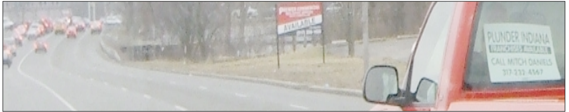
A truck sports a placard "Plunder Indiana" and urges a call to Gov. Daniels.

As Gov. Daniels toured the toll road tier counties last