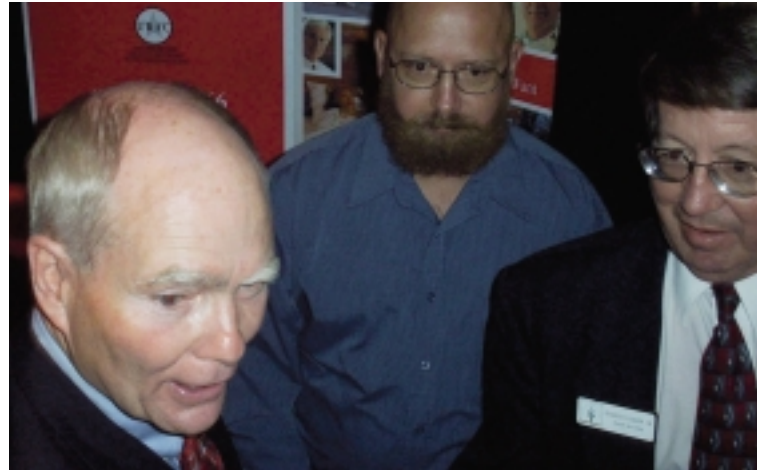
Gov. Joe Kernan chats with Indiana Building Trades Council labor leaders on Wednesday in Indianapolis. Kernan said he predicted Notre Dame's upset of Michigan two weeks ago and said ND would defeat Purdue 31-28 this Saturday.