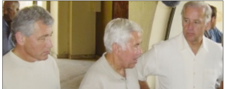
Sens. Hagel, Lugar and Biden in Iraq in 2003. All three senators on the Foreign Relations Committee have been sharply critical of U.S. reconstruction efforts.

"But all three CIA scenarios were awful, I pointed out," Klein continued. McClellan began to read from talking points. The "pessimists and naysayers" had been wrong, he said, about the Iraqi people's ability to establish a transitional