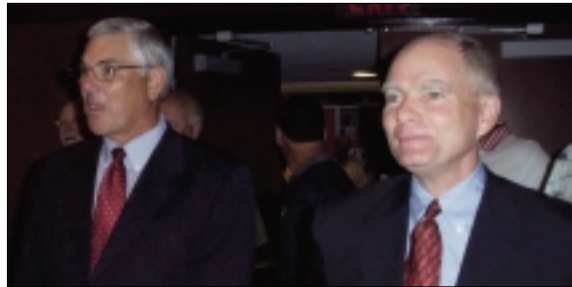
Gov. Joe Kernan with Ben Ramsey of the Building Trades Council.

The Kernan-Davis campaign hopes that the big TV buy on the IPALCO, college tuition and health care issues will swing the 10-12 percent undecideds.