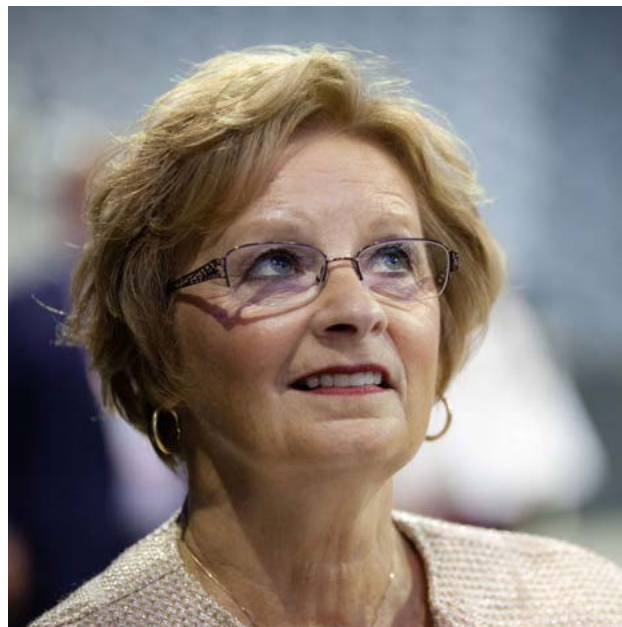
Secretary of State Connie Lawson doesn't believe the Russians successfully hacked Indiana's election system.