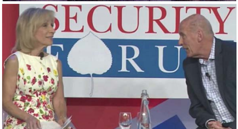
Ambassador Coats with German Chancellor Schroeder (top) and 200,000 Germans at the Brandenburg Gate following the Sept. 11 attacks, and in 2018 learning from NBC's Andrea Mitchell about a proposed White House visit by Russian President Putin.

a read-out of the private Trump/Putin meetings, though there is speculation that U.S. intelligence agencies gleaned some of what they discussed through clandestine Russian sources.