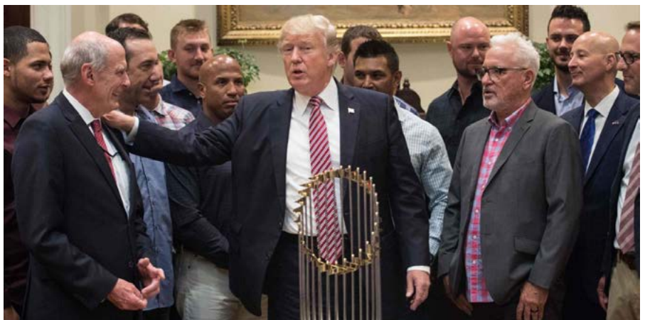
Director of National Intelligence Dan Coats welcomes the World Series Champion Chicago Cubs to the Oval Office with President Trump.

small town mayor and district attorney who claims to have prosecuted terrorism cases, though there is no evidence that he did. He is a political defender of Trump, who has auditioned on Fox News, which is now the proving ground for economic advisors, United Nations ambassadors, and White House and Foggy Bottom communicators.