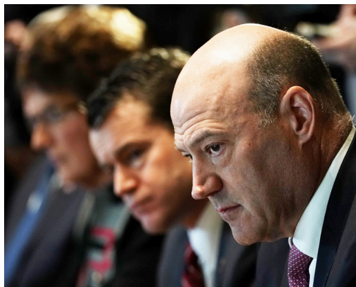
Rep. Walorski with Sen. Todd Young and former Trump economic advisor Gary Cohn.

Walorski: I think it's the same perspective. My job on that committee and being elected to represent my district is to make the inroads. My job is to make sure I'm in front of those guys and talking and bringing this stuff back into Hoosier common sense. Let's protect our manufacturers, let's not get into something with our farmers that we can't pull back. I don't see things slowing down. This is a 24/7 issue. I just left a group in Indianapolis and I told them, "This is what I do 24/7 right now, me and my staff. We are on this and getting as much information as