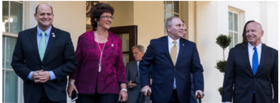
Rep. Walorski and congressional Republicans pressing their case on tariffs at the White

HPI: There was a Reuters story in February that said Mexican imports of Brazilian corn increased by 970%