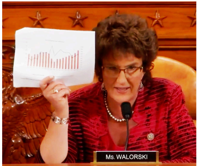
Rep. Walorski holds up bar charts revealing potential job impacts of President Trump’s proposed tariffs while questioning Commerce Sec. Wilbur Ross last month.

been involved with this long before this was a public conversation. I’ve known the tariffs were coming since the fall of last year. I’ve been keeping my nose to the grindstone knowing that when Trump did announce these, and he announced them as blanket tariffs, it would be my job on