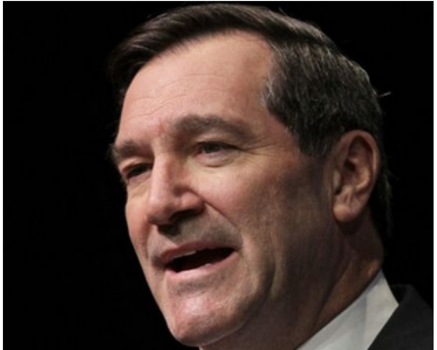
The results of the final Howey/DePauw Indiana Battleground Poll reveal how fateful those words were. In

And then there was New Albany, Oct. 23, 2012, where Mourdock, in a tactical political sense, was soooooo bad. Mourdock was in a dead heat race with Democrat Joe Donnelly, six months after his epic landslide upset of U.S. Sen. Dick Lugar. With every known poll showing the race within the margin of error, Mourdock waited 45 minutes in this debate before uttering the words that would define a U.S. Senate race in a Todd Akin déjà vu moment, and possibly alter majority control: “. . . even when life begins in that horrible situation of rape, that is something that God intended to happen.”