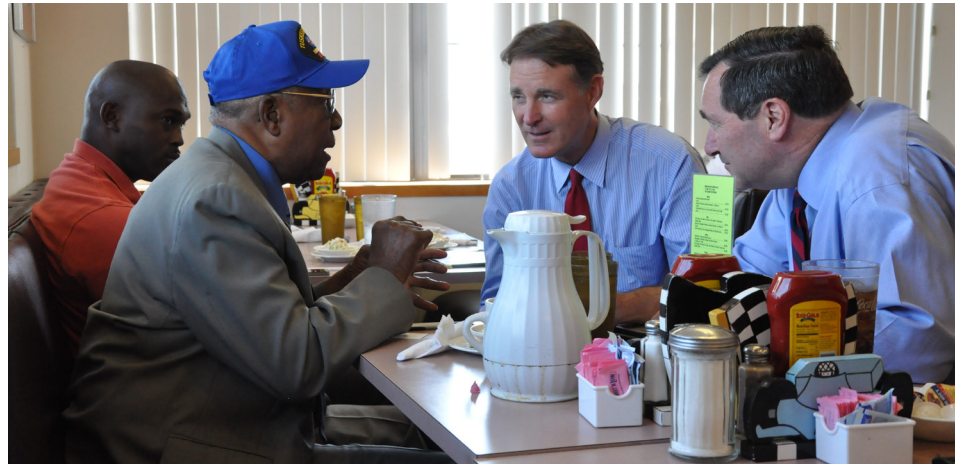
Democratic Senate nominee Joe Donnelly (left) campaigned with former governor and senator Evan Bayh in Indianapolis on Wednesday. The pair will be in Fort Wayne, Plymouth and East Chicago today.

Mourdock won a bitterly contested Republican primary against U.S. Sen. Dick Lugar. In that showdown, Mourdock played to his Tea Party supporters which helped him win a stunning 61-39% upset. But in doing so, Mour-