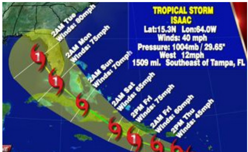
Hurricane Isaac may join Republicans in Tampa for the national convention that begins Monday. The Wall Street Journal reports today the storm could cancel the convention

"For the last eight presidential elections, this model has correctly predicted the winner," said Berry. "The economy has seen some improvement since President Obama took office. What remains to be seen is whether voters will consider the economy in relative or absolute terms. If it's the former, the president may receive credit for the economy's trajectory and win a second term. In the latter case, Romney should pick up a number of states Obama won in 2008." ❖