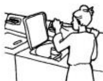
Clothes Washer Washing Machine