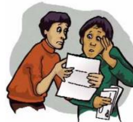
Read Mail & Notices