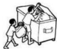
Dumpster Trash Garbage