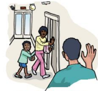
Be a Good Neighbor