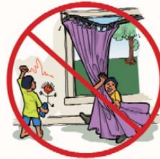
Take Care of Property