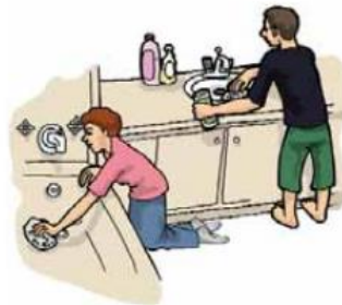
Keep Things Clean