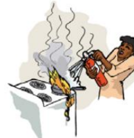
Know How to Deal with Emergencies