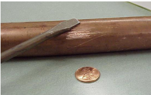
Copper Pipe (Green Bay Water Utility)