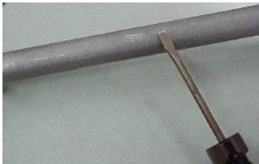
Galvanized steel pipe (Green Bay Water Utility)