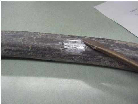
Lead Pipe (Green Bay Water Utility)