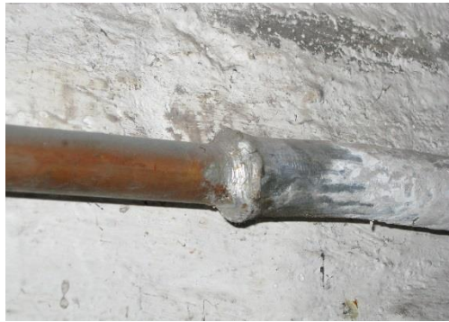
Lead Service Line