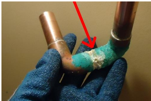
Oxidized copper pipe (Tom W. Sulcer)