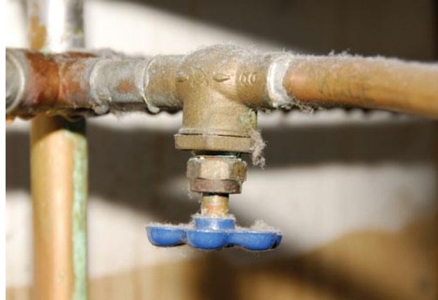
Copper pipes with lead solder and a brass fitting