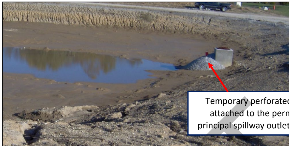
Exhibit 708.04-C. A temporary perforated riser dewatering device has been installed on a post-construction storm water basin modified outlet structure so the basin can function as a sediment basin. Once construction and land disturbing activities are completed the riser can be removed and the permanent outlet features, orifice holes etc., will be implemented. Note basin banks require stabilization with seeding and mulching.