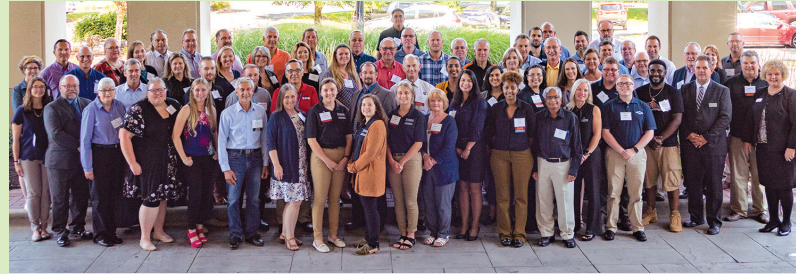
Partners members at the Pollution Prevention Conference and Trade Show, 2019