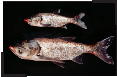
Two bighead carp demonstrating a size comparison