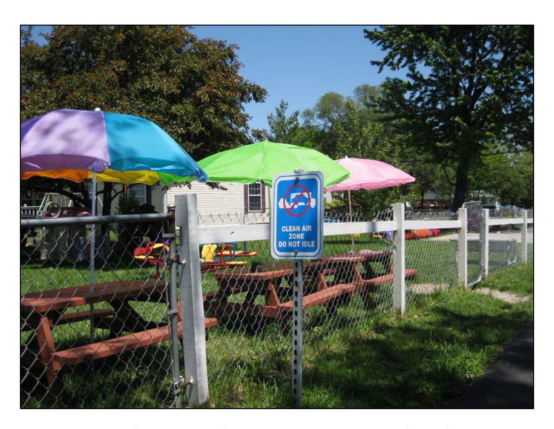
"No Idling" Sign posted at Sugar N' Spice Day Care in Indianapolis.

In partnership with the Indiana State Department of Health Asthma Program, "10 Reasons Not to Idle" was printed and distributed to child care providers and parents. This eye-catching brochure focused on the truths about vehicle idling. It was designed to end misconceptions about engine idling and air emissions. Very popular among child care providers, more than 1,000 brochures were quickly distributed. Because funds were limited, the brochures ran out quickly and providers began distributing brochures only to "problem" parents as a tool to start a non-confrontational conversation about turning their cars off. The brochure is now available online at <a href="https://www.in.gov/isdh/files/Idling_Brochure.pdf">www.in.gov/isdh/files/Idling_Brochure.pdf</a>. Members were also given additional reminders to provide parents and bus drivers about why the initiative is important and how they can help (Attachment B).