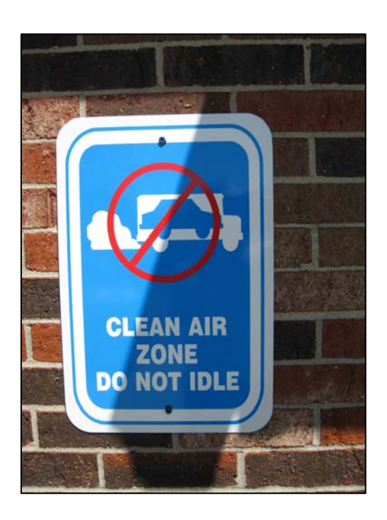
Sample "No Idling" Sign purchased with funding from Duke Energy.

Child care providers were asked to classify their knowledge about environmental dangers with idling vehicles. They chose between the four levels listed below and definitions for each level were provided.