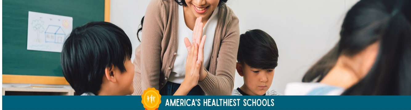
AMERICA'S HEALTHIEST SCHOOLS

Click here for more information on how to apply. Applications are due Tuesday, April 16.