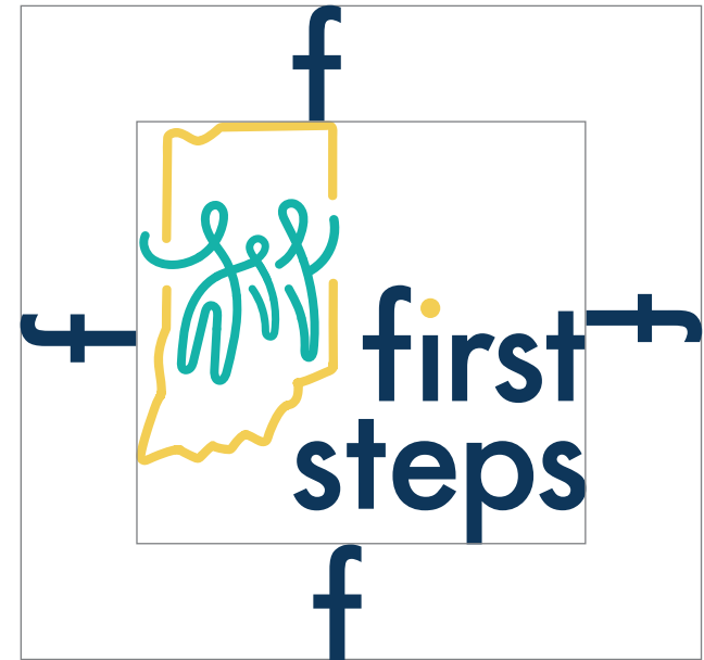
Safe area around logo.