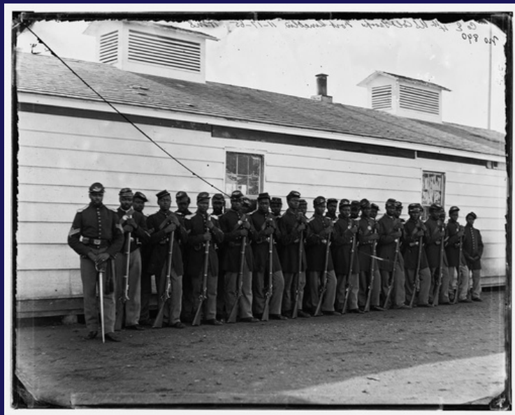
The Twenty-Eighth Regiment was assigned to the Fourth Division, U.S. Colored Infantry. Company E of the Fourth Division is shown here sometime between 1863 and 1866 at Fort Lincoln during the Civil War.

The story of Indiana's black veterans is one of triumph over adversity. In the early days of the Republic, when the nation was torn asunder by the Civil War, thousands of black Hoosiers answered the call to arms, eager to fight for their freedom and the promise of a better future. Despite facing prejudice and discrimination both on and off the battlefield, these brave men distinguished themselves through their courage and tenacity, earning the respect of their fellow soldiers and the admiration of future generations.