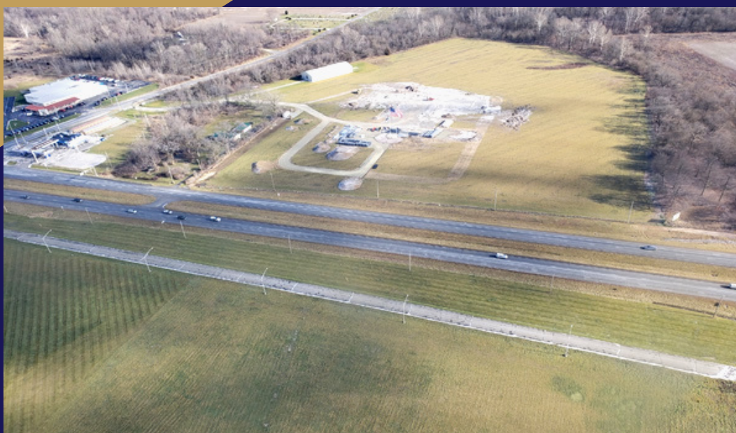
Aerial view of the site of the new museum.

Veterans and patriots can learn more about the Gathering event by clicking here .