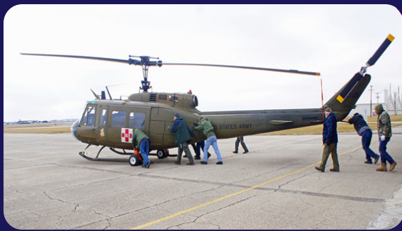
The Army UH-1H #70-16369 exiting the hangar.