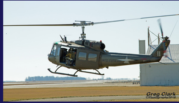
The Army UH-1H #63-08803 flies again.

PERU, Ind. – American Huey 369, in association with the National American Huey History Museum, will celebrate 16 years of restored Huey flight at the annual Gathering of Veterans and Patriots on August 13-14 at what will become the site of the new Huey museum in Bunker Hill, Ind.