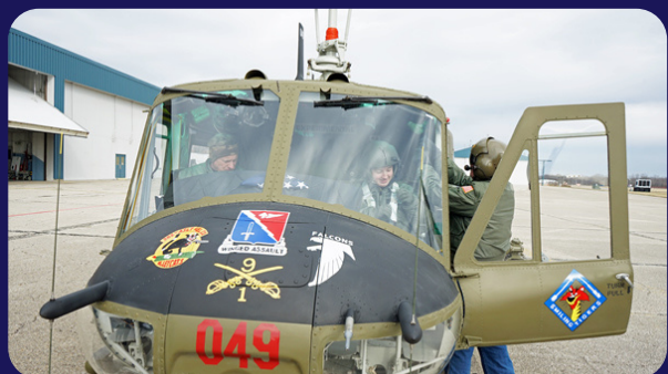
Preparing to fly the 049 Gunship.