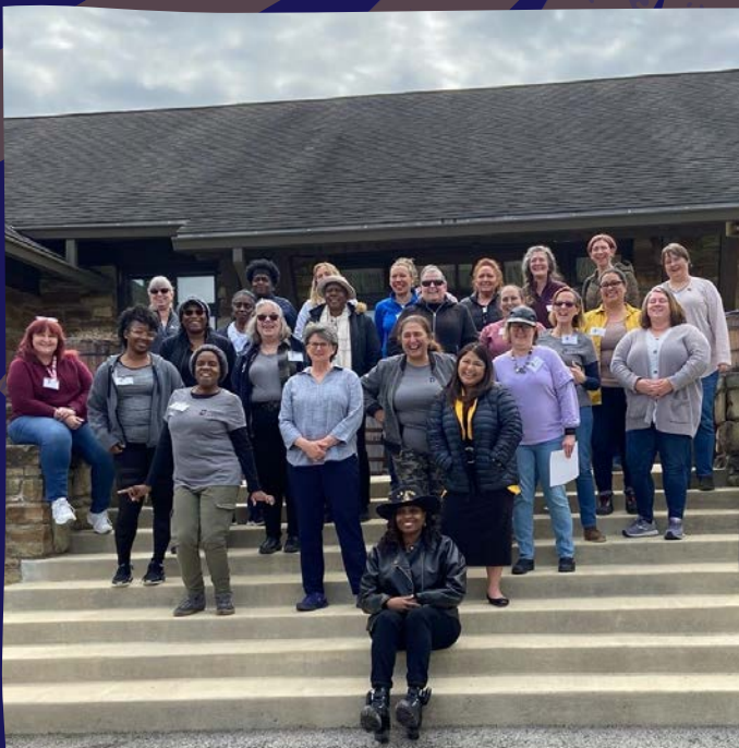
Women veterans attend the first women veteran wellness retreat April 1 to 2 at Brown County State Park.