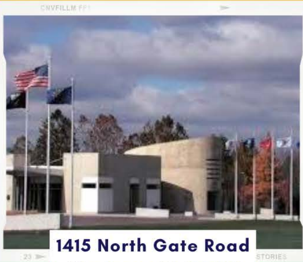
1415 North Gate Road Madison, IN 47250

The Indiana Veterans Memorial Cemetery is open for visitors. Please follow all COVID-19 guidelines: