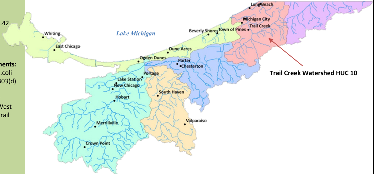
Trail Creek Watershed HUC 10

The Lake Michigan Coastal Program supports coordination and partnerships among local, state, and federal agencies and local organizations for the protection and sustainable use of natural and cultural resources in the Lake Michigan region. The Little Calumet-Galien Watershed, encompassing the entire area below, is the focus of the coastal program's Nonpoint Source Pollution control efforts.