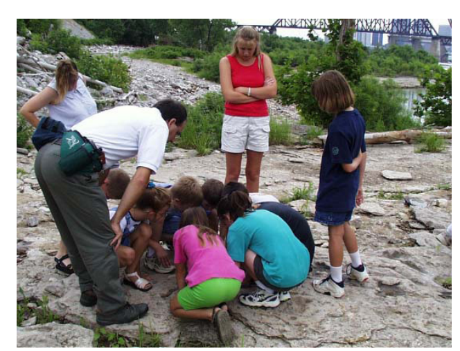
Finding fossils at Falls of the Ohio