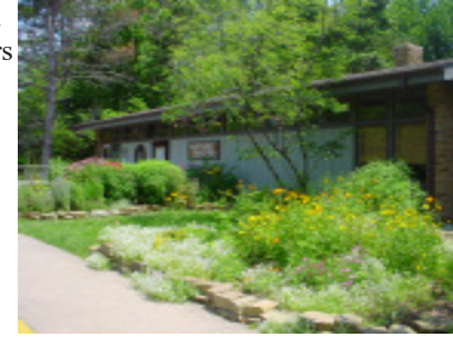
Visitors to Brown County's Interpretive Center are greeted by a garden of native flowers