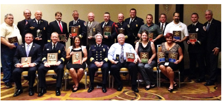
IERC presented its annual awards on August 21. Winners are pictured above.