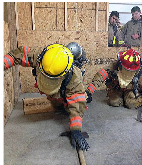
Patoka firefighters practice in their recently dedicated training center, which contains a stair prop and a window for ingress and egress practice.

Andi Wainscott, Switzerland County Sheriff's Department Over a five-hour period, Wainscott dispatched and helped coordinate more than 100 emergency responders and public works staff, including outof-state resources, to rescue a man pinned 12 feet down in a collapsed trench. Wainscott worked that shift