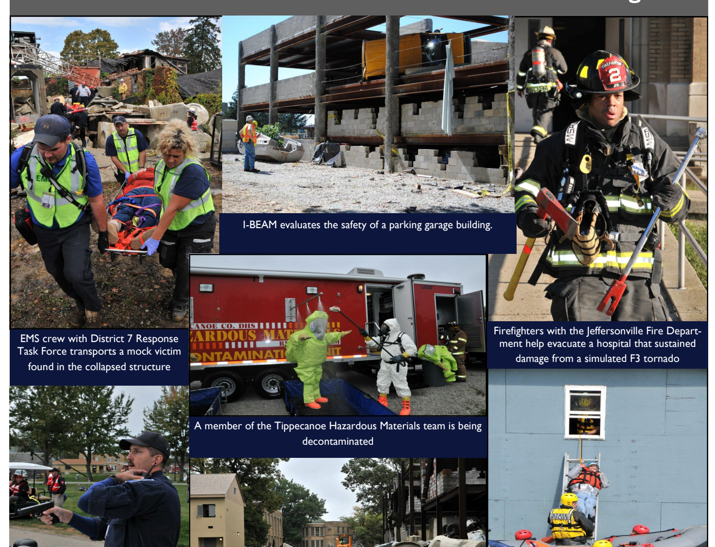
Law enforcement with DRTF 8 maintains a perimeter during the simulated gunman situation