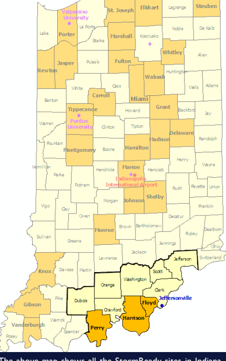
The above map shows all the StormReady sites in Indiana. Perry County Received their StormReady designation on October 5, 2011.