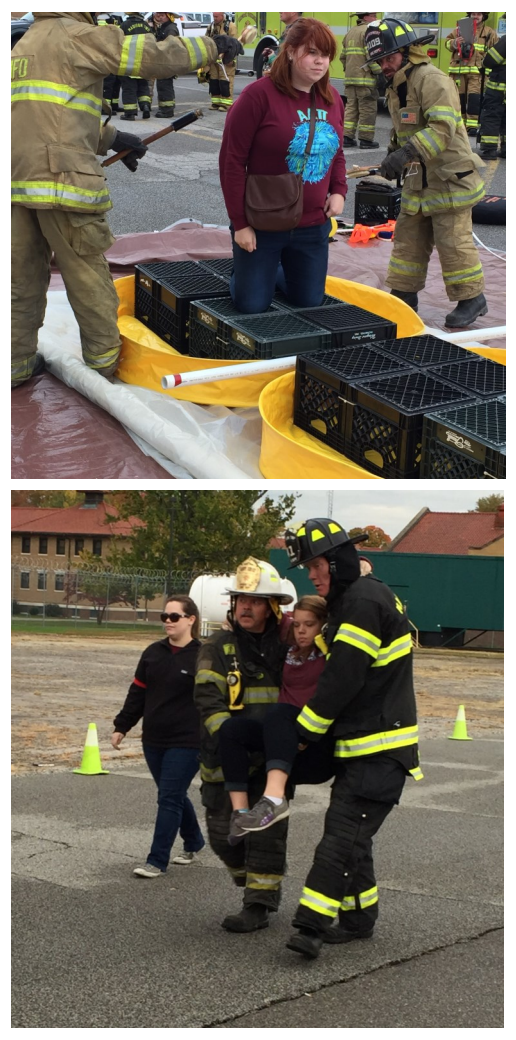
The Jefferson County LEPC hosted an exercise at Madison State Hospital which included a chemical spill scenario. Student volunteers from Ivy Tech Community College and Hanover College played victims.

Community exercises give emergency responders the opportunity to work together to problem solve in different scenarios and find opportunities for improvement. The Jefferson County LEPC holds a full-scale community drill every other year; they host table -top exercises on alternating years.