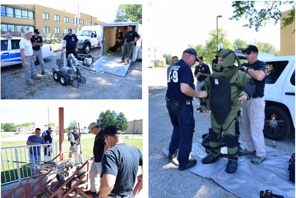
ISP and IDHS participated in an explosives ordinance training exercise at Muscatatuck Urban Training Center from Sep. 14-18. In a variety of scenarios, participants used different resources such as explosive disposal robots (center) and bomb protection suits (right).

Participants in this training session engaged in different scenario-based exercises, using resources such as explosive detection K-9 units, X-ray systems, bomb protection suits and explosive disposal robots. These robots can be controlled from a separate area, away from an