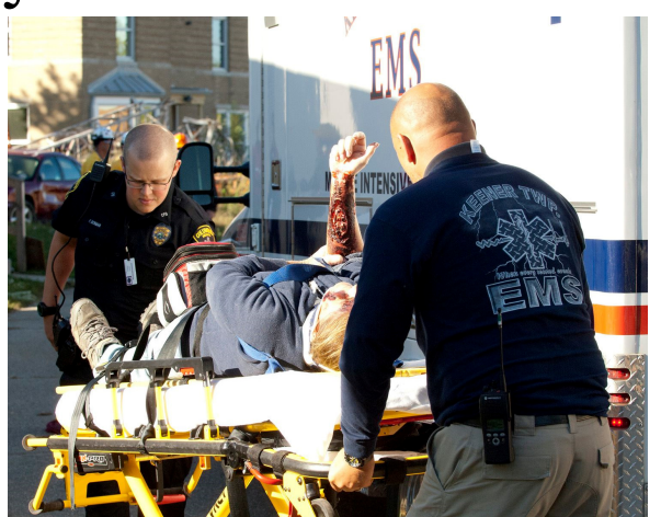
A Keener Township, Jasper County, Ind., Emergency Medical Technician and a Columbus, Ind., Patrolman load a mock victim into a Kenner Township ambulance at Muscatatuck Urban Training Center in Butlerville, Ind., on Sep. 23, 2013, during the IDHS exercise Tipton Twister.

Emergency Medical Services are frequently the entry point to Indiana's healthcare system. EMS Week recognizes professionals' dedication and encourages communities to better know their local EMS providers.