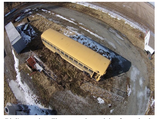
Bird's-eye view: First responders training for a school bus rescue in Henry County can get detailed images on mobile devices while en route to the scene.

Huffman is aware that UAS use can be controversial, with some citizens concerned about safety and privacy, but specialized training and adherence to FAA rules are required for operations. To increase transparency, all images taken by the Henry County EMA drone will be