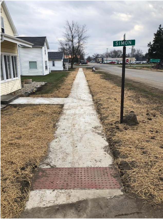
At Simon Street looking South (Eastside)