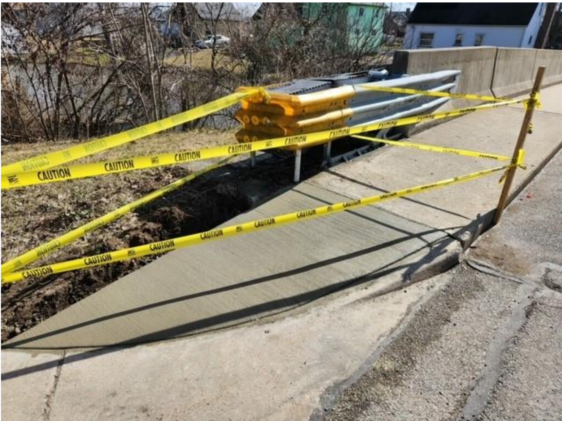
Bridge 1 - After