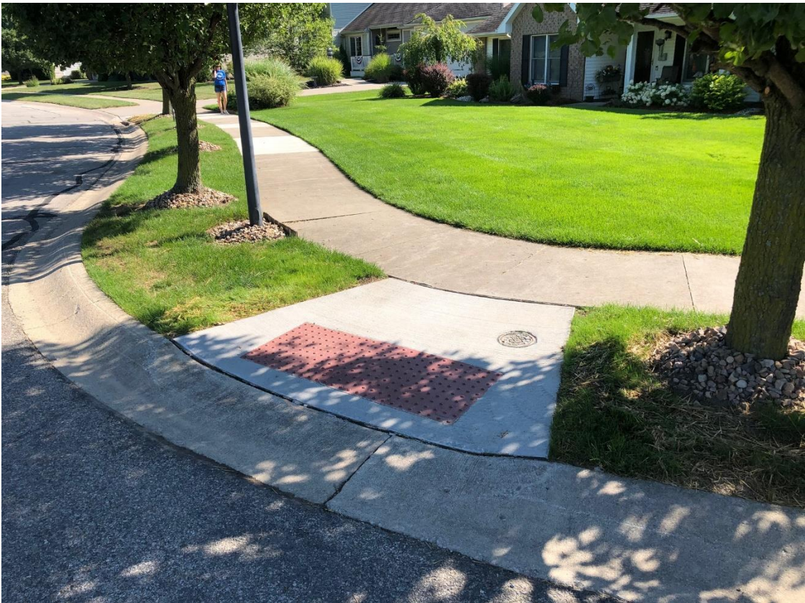
4 – Ballenshire Lane