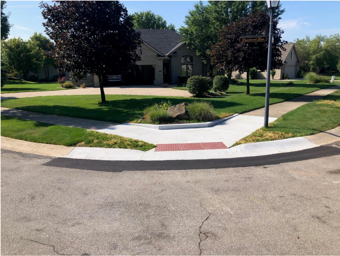
1A – Cobblestone Lane