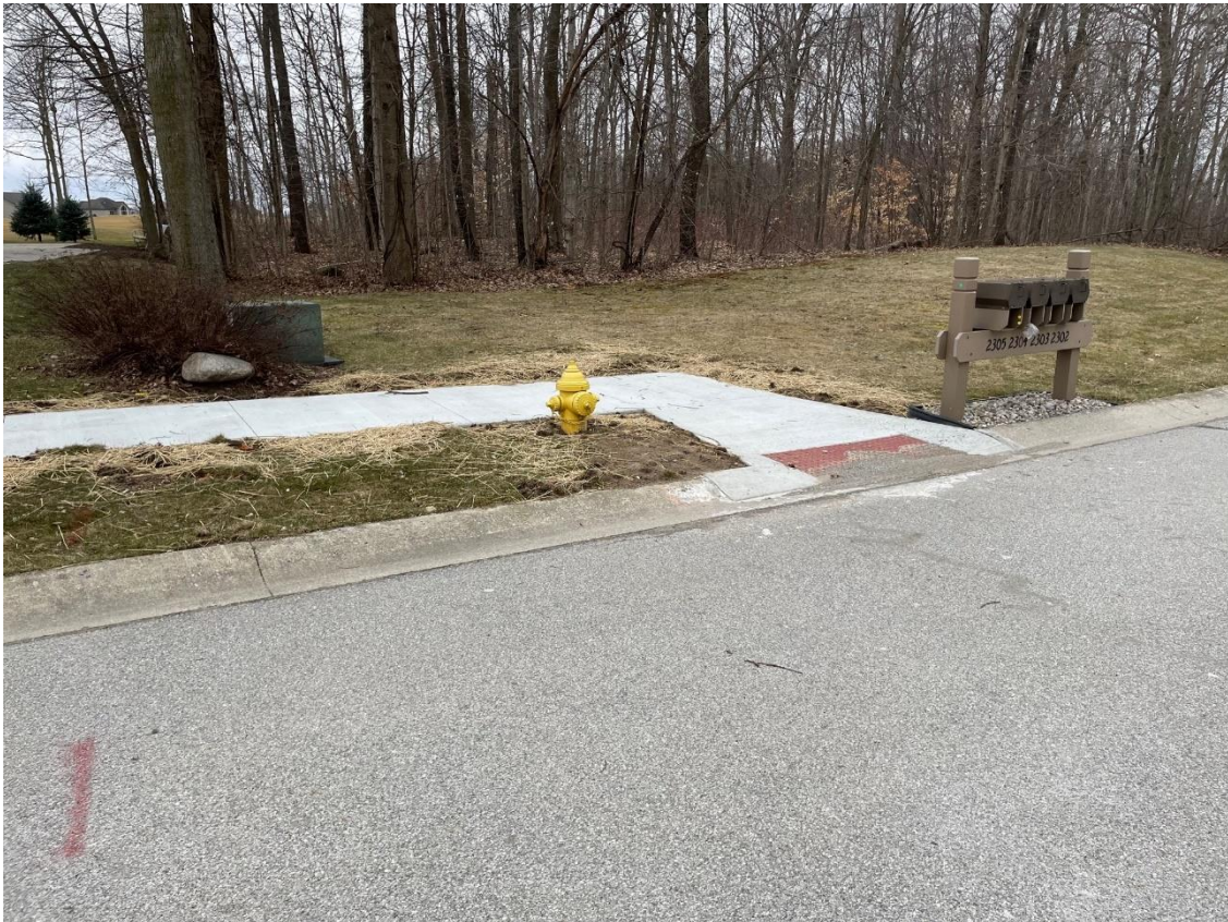
Ramp - 7A