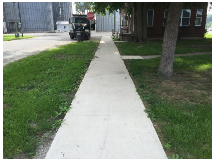
Asphalt was placed to match the concrete to the road.