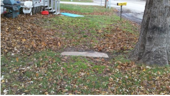
ADA Sidewalk, Wawaka 2016