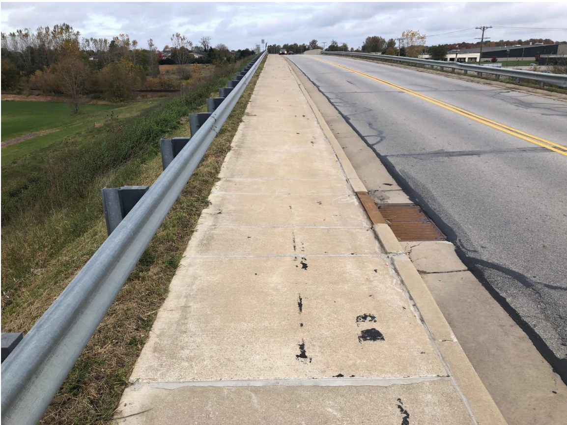
CR 1000 East looking north at Bridge 5