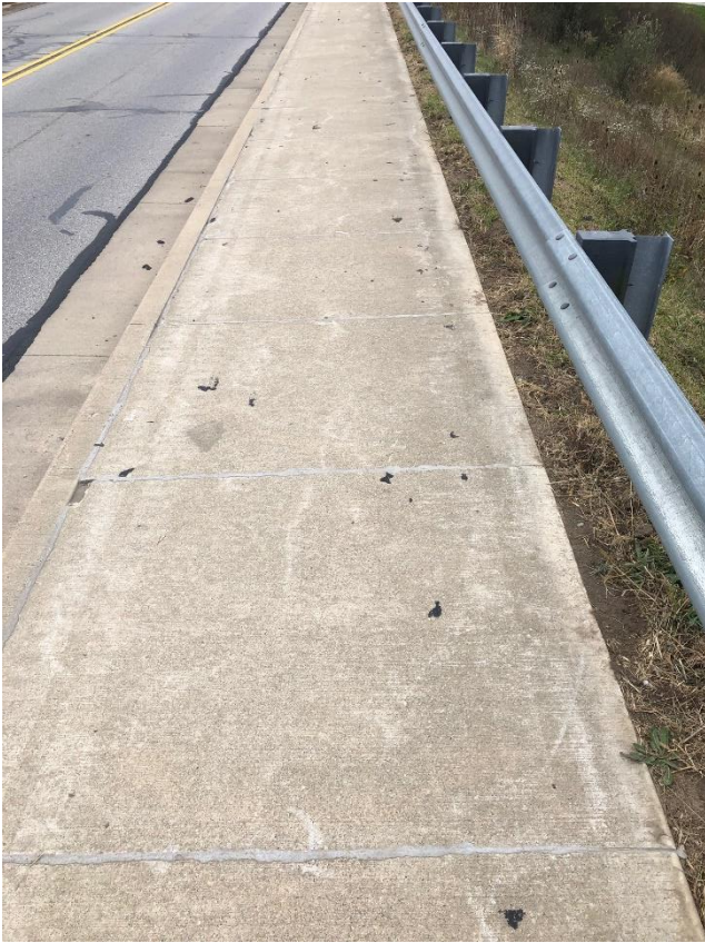
Crackfill / Crackseal