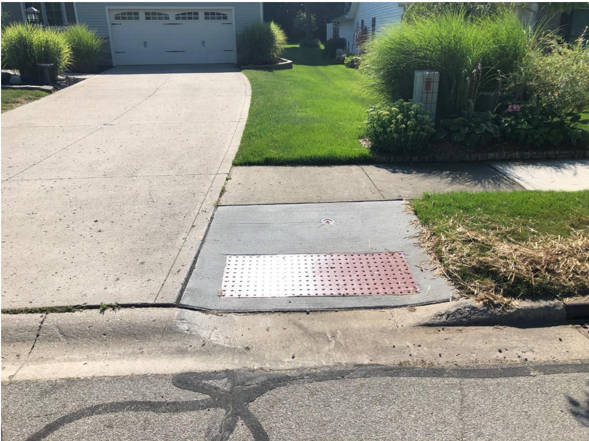
5 – Carnoustie Circle