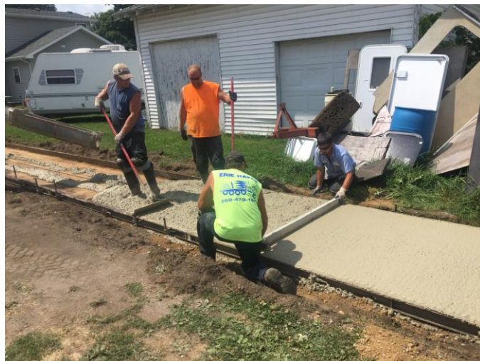
Forms were set and concrete poured on August the 15 th .