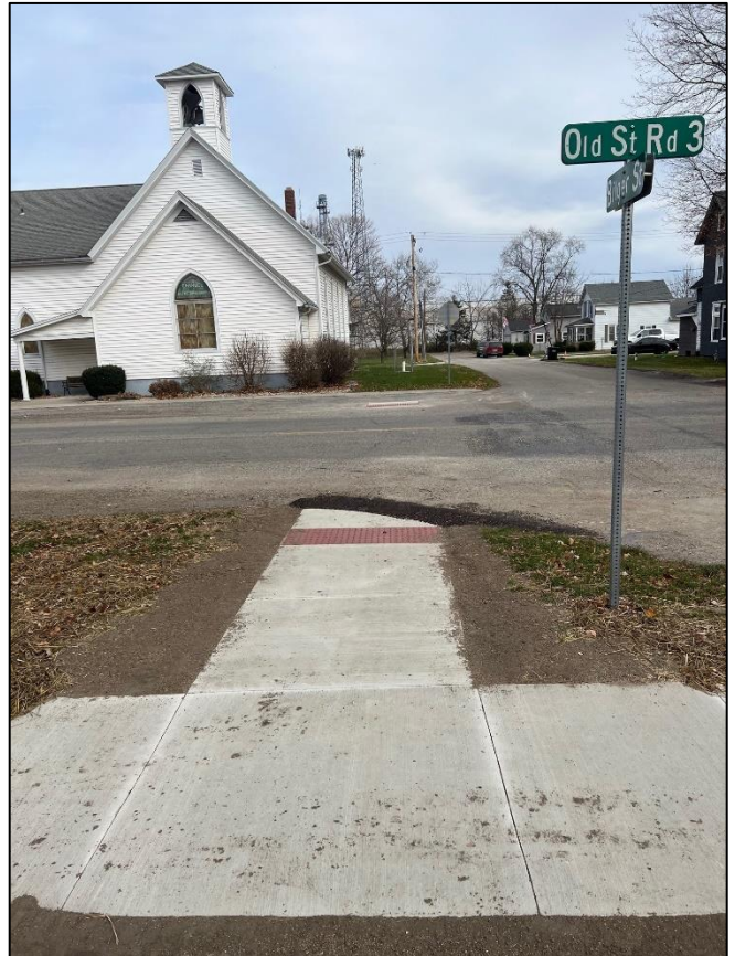
Bilger Street (Section 13 to 15 Transition)