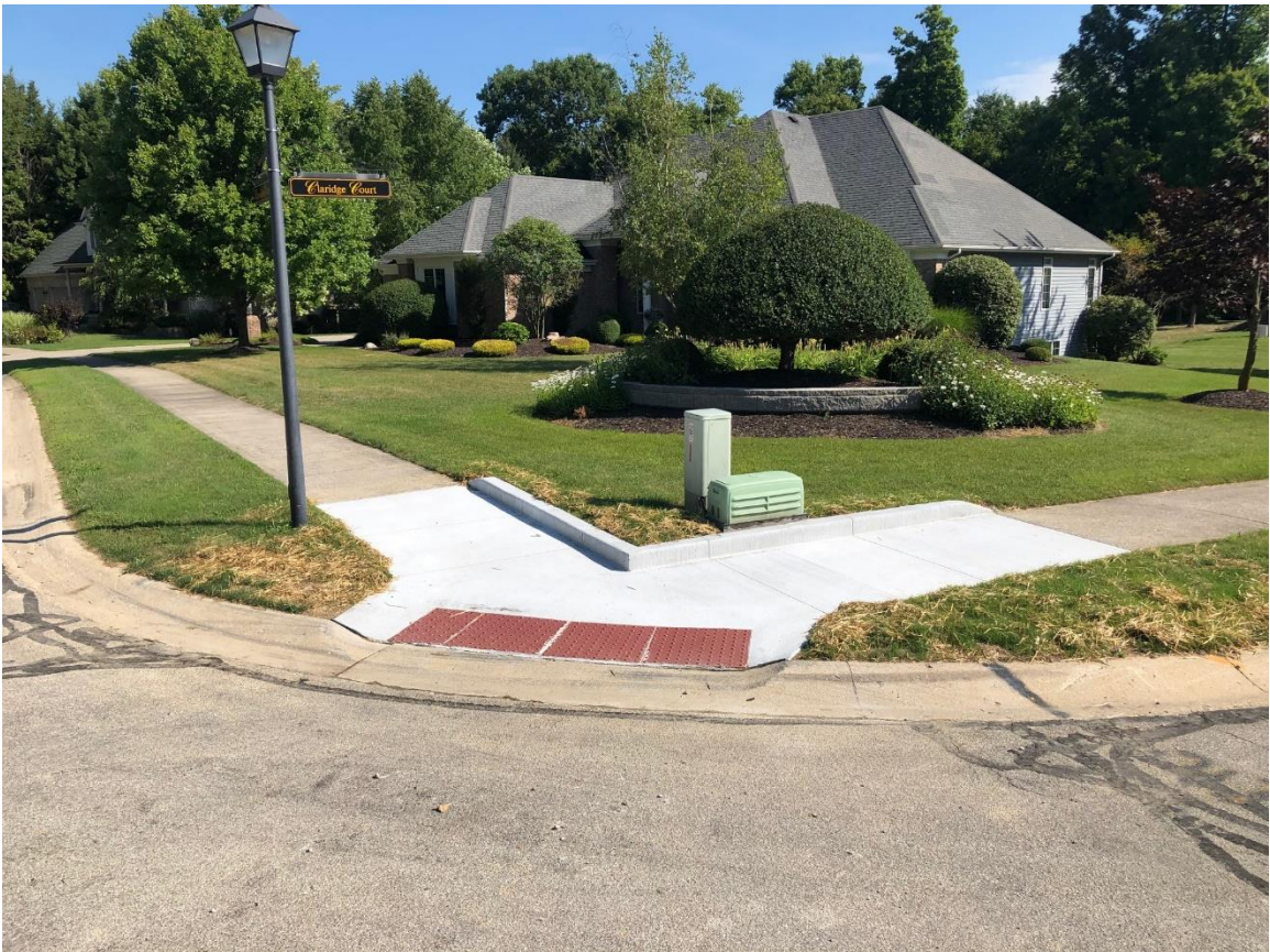
7B – Carnoustie Circle