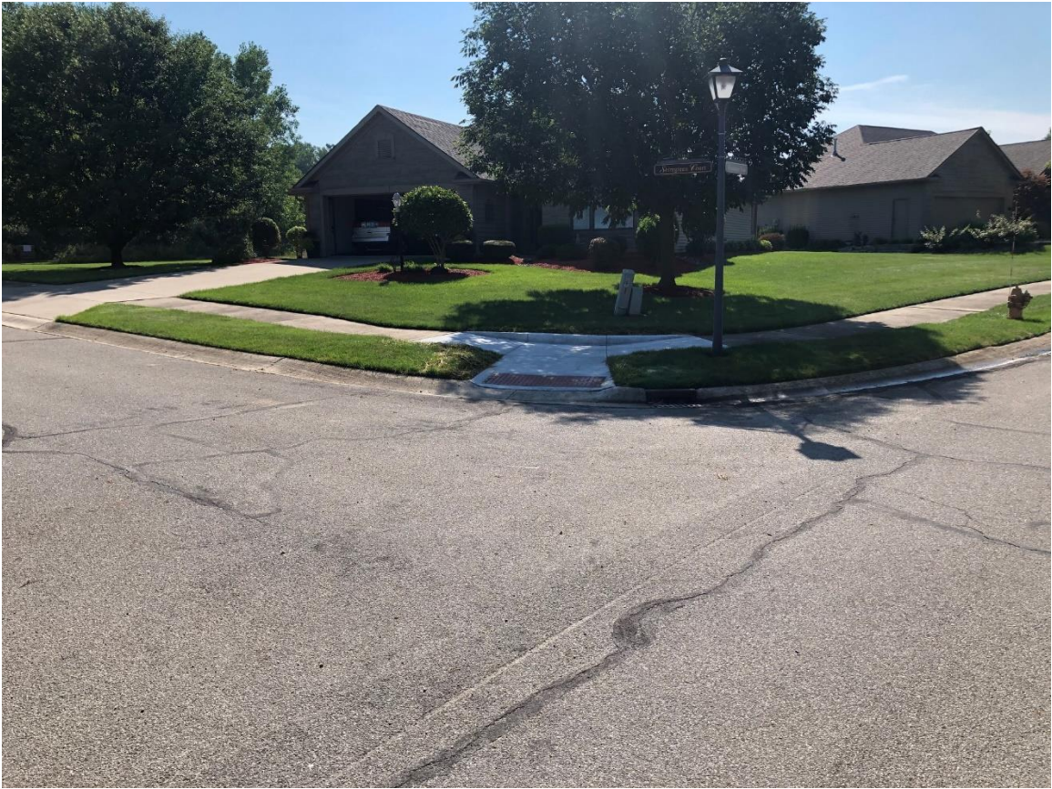
2A – Laurelwood Lane