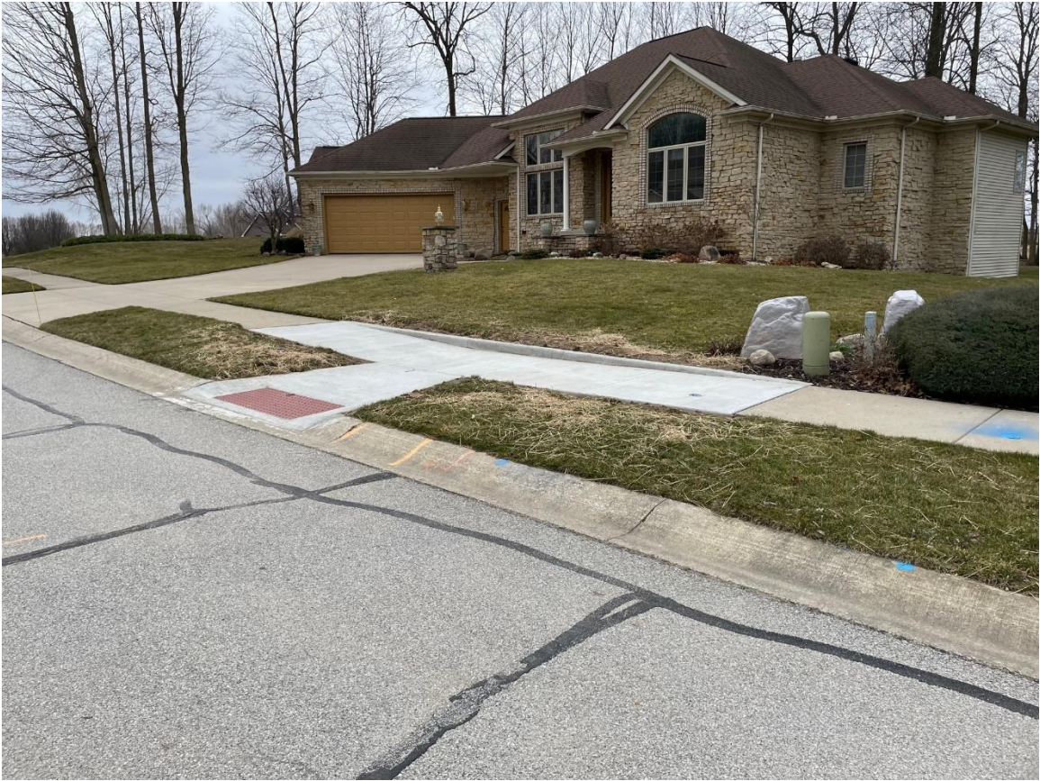
Ramp - 7B