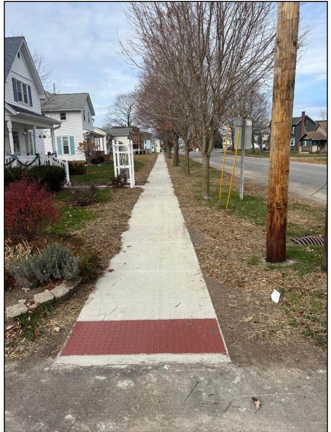
Woodlawn Street (End of Section 15)