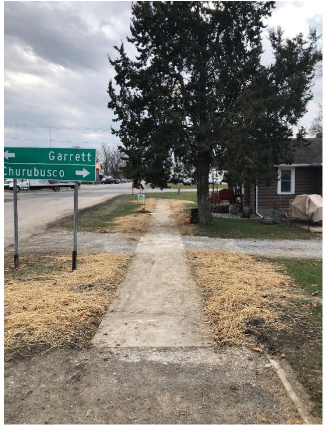
North of SR 205 looking South (Westside)