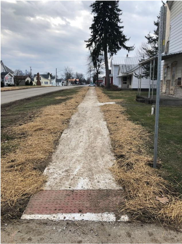
At Vorhees Street looking South (Westside)