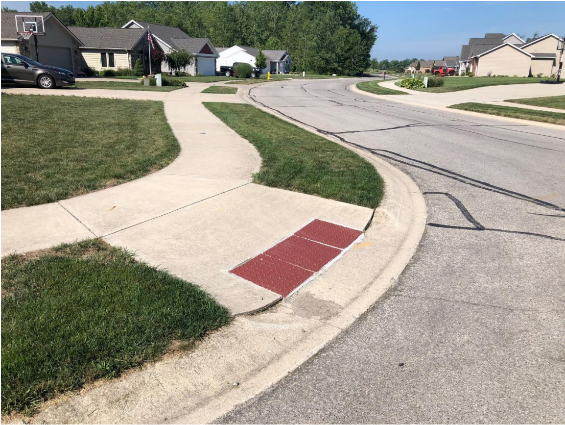
4 – Ballenshire Lane