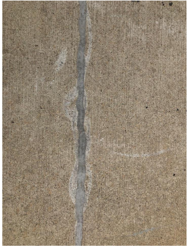
Crackfill / Crackseal (sidewalk joint)