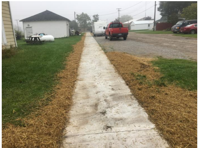
September 14 th day after seeding.