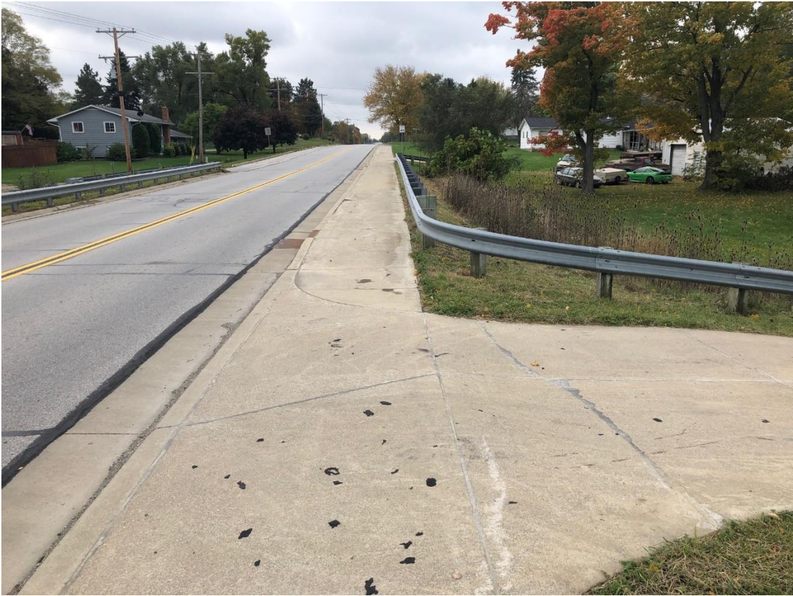
CR 1000 East looking south at Bodenhafer Drive