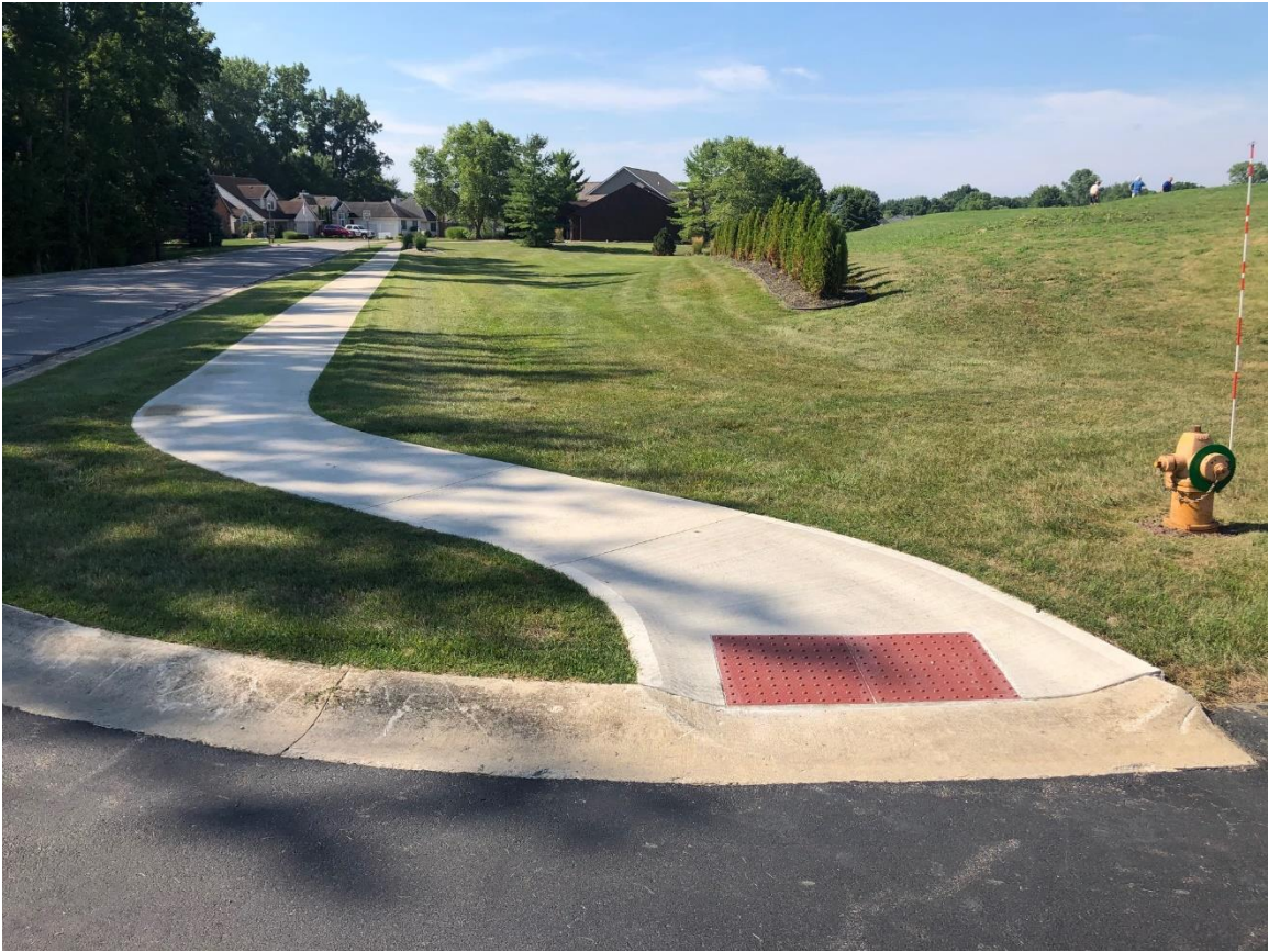
3A – Cobblestone Lane