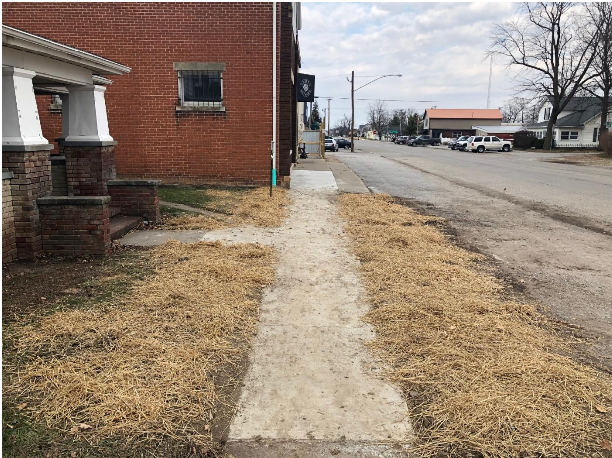
South of Collins street on the Westside of SR 205 looking North