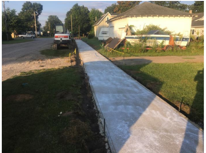
August the 16 th day after concrete was poured.