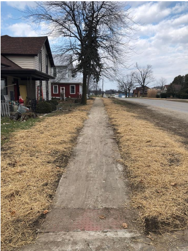
At Simon Street looking North (Westside)