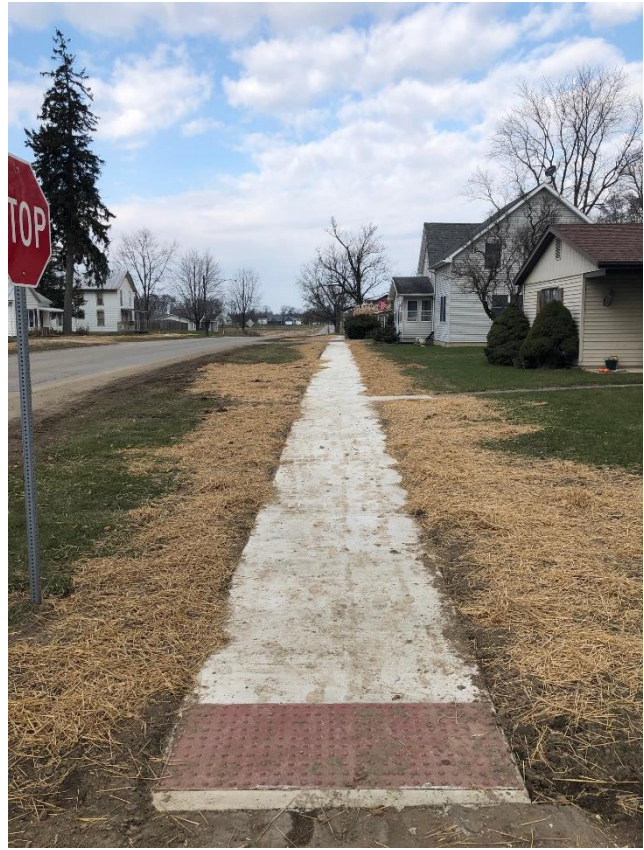
At Simon Street looking North (Eastside)