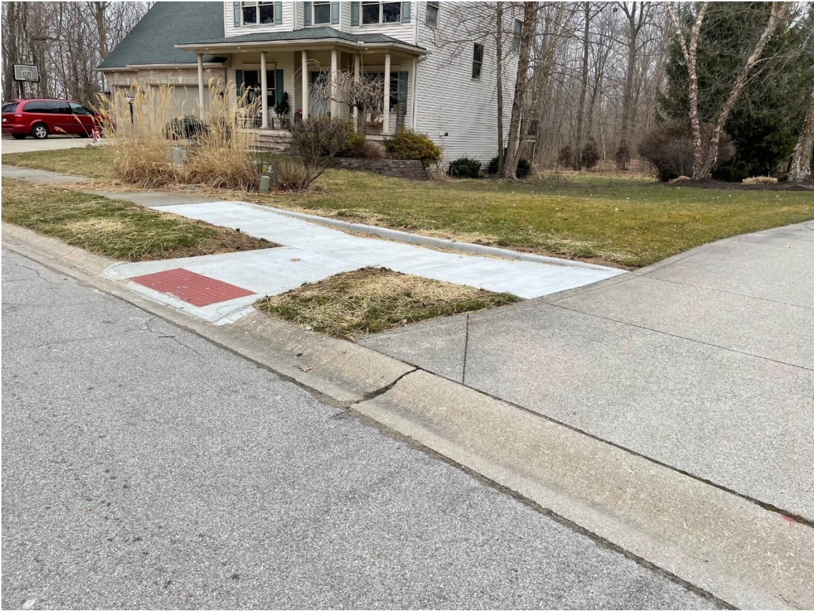
Ramp - 6C