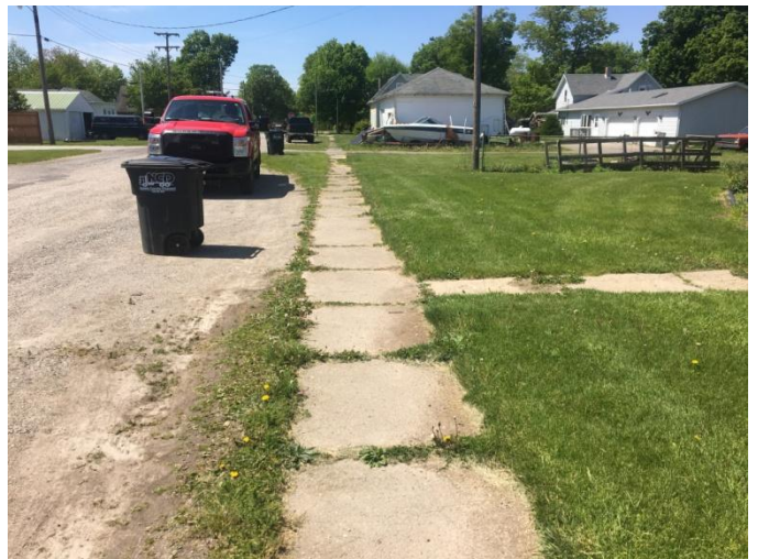
Photos of existing conditions taken summer of 2017 before work began.