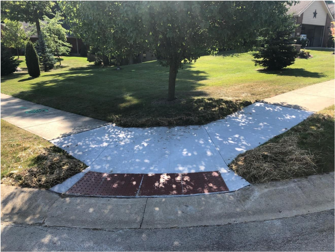
7A – Carnoustie Circle