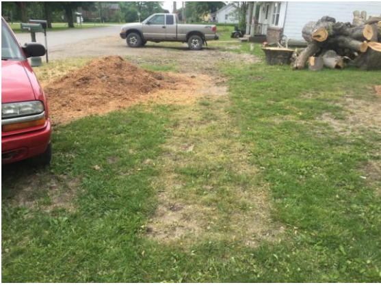
ADA Sidewalk, Wawaka 2016