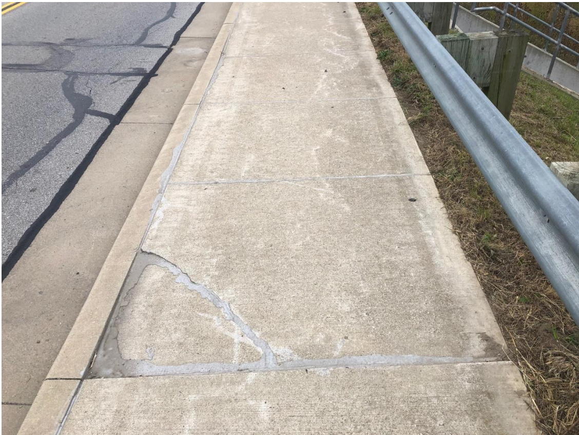
Patching / Minor Repair