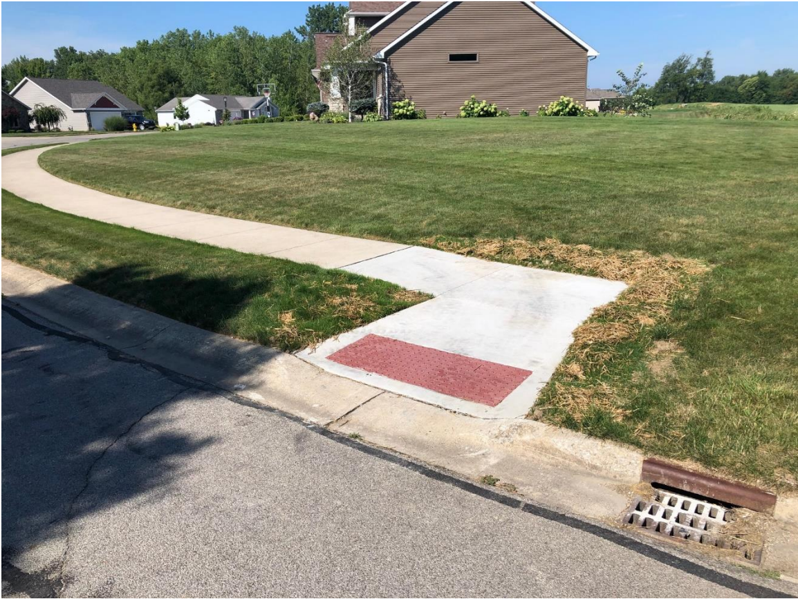
5 – Carnoustie Circle