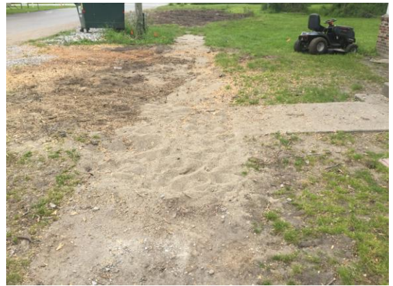
ADA Sidewalk, Wawaka 2016