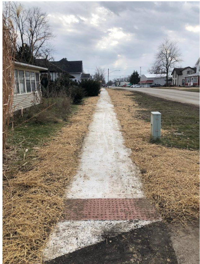
At Vorhees Street looking South (Eastside)