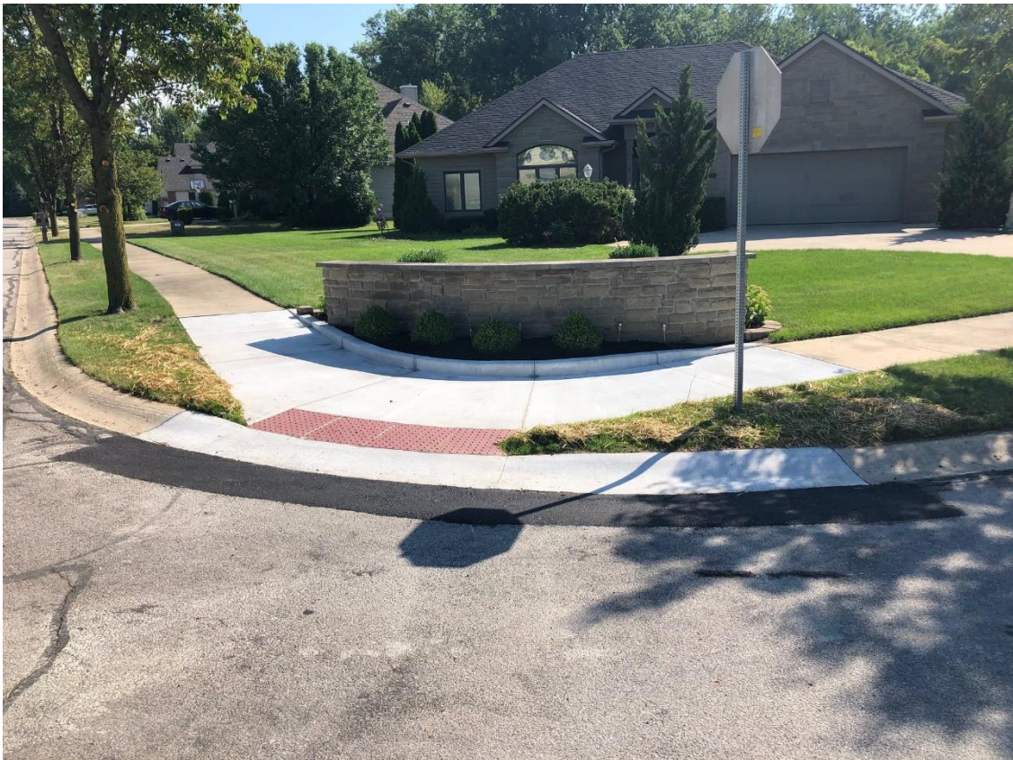
1B – Cobblestone Lane