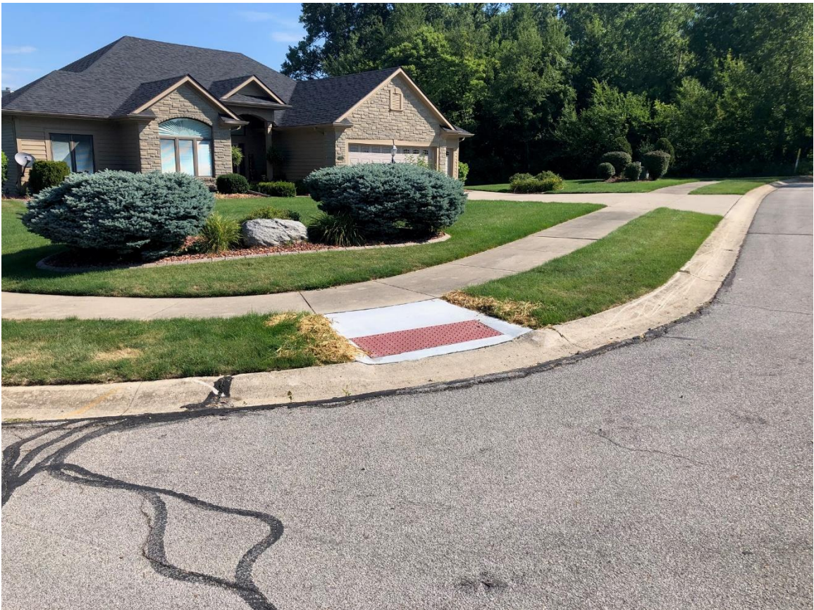
2B – Laurelwood Lane