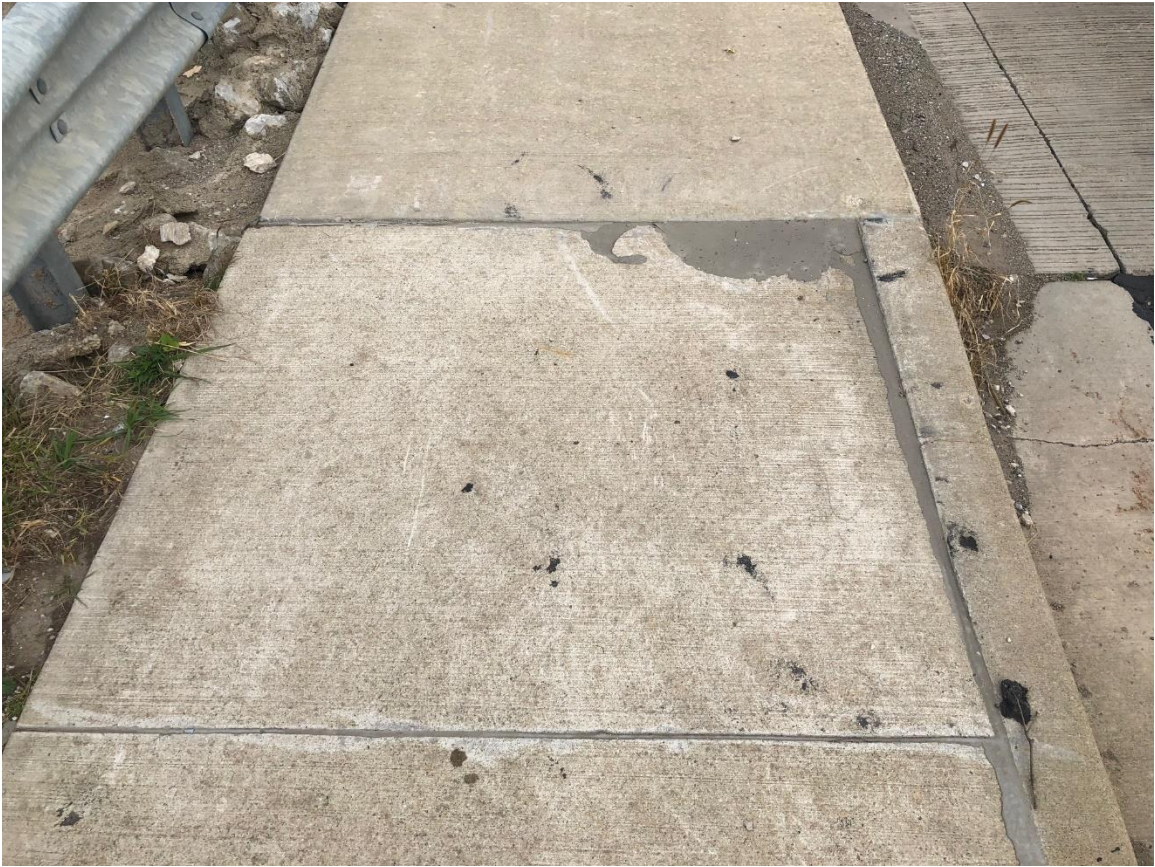
Repairs on Bridge 5 sidewalk