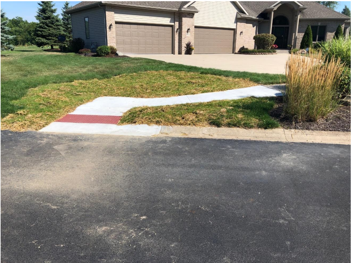
3B – Cobblestone Lane