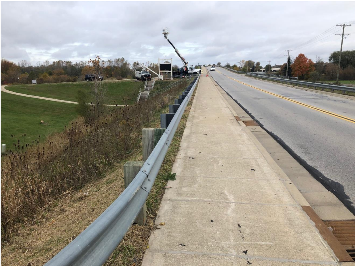
CR 1000 East looking north at Complex Entrance