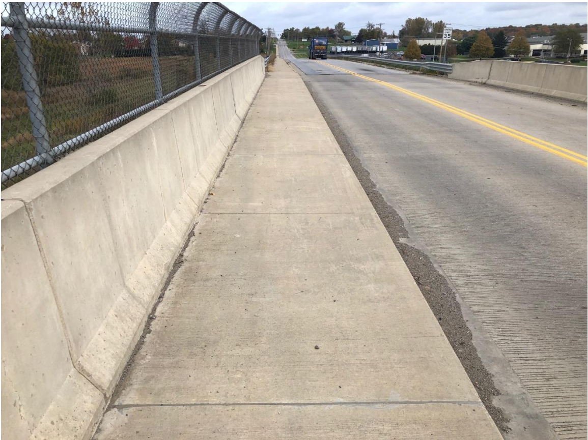
CR 1000 East on Bridge 5 looking north