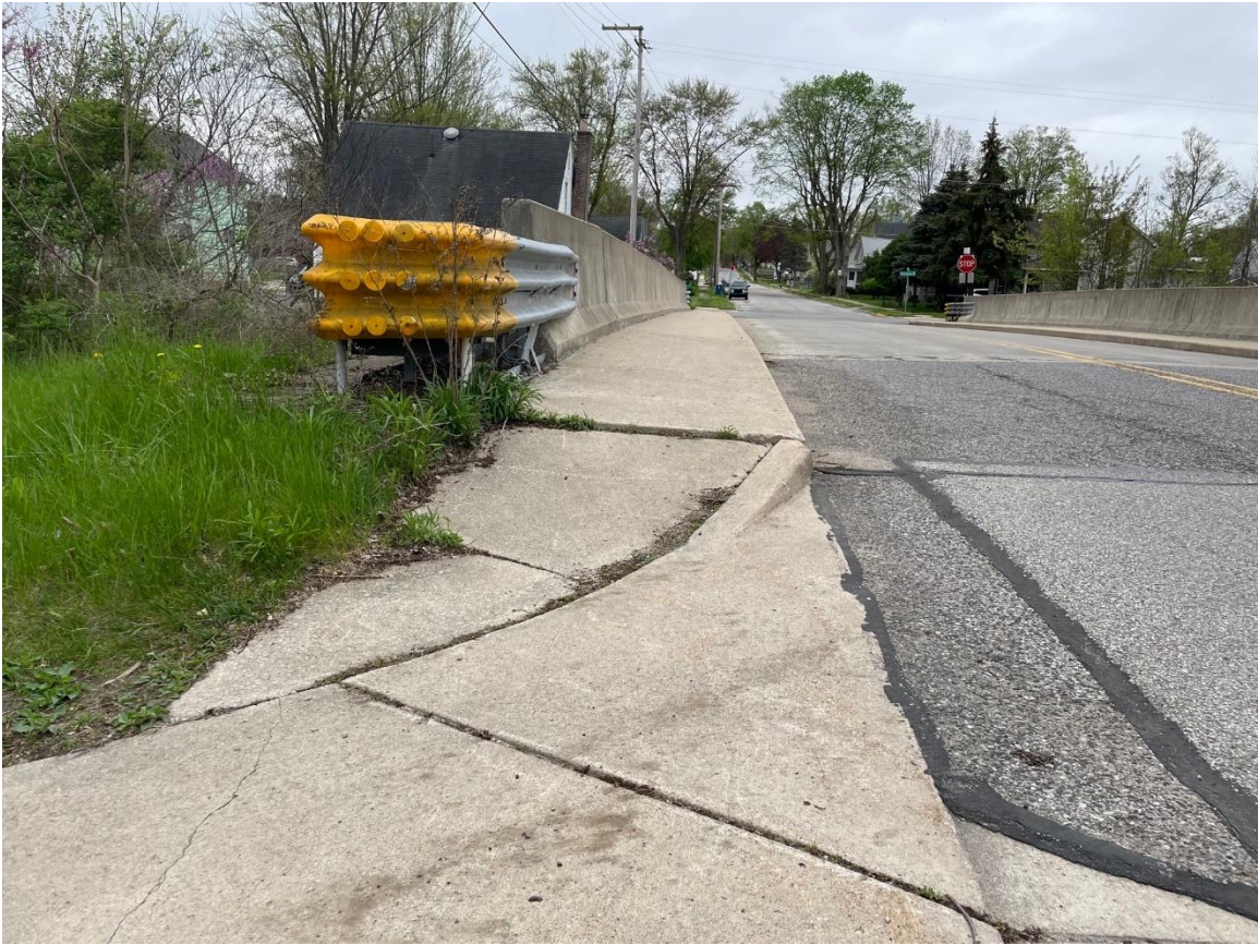
Bridge 1 - Before