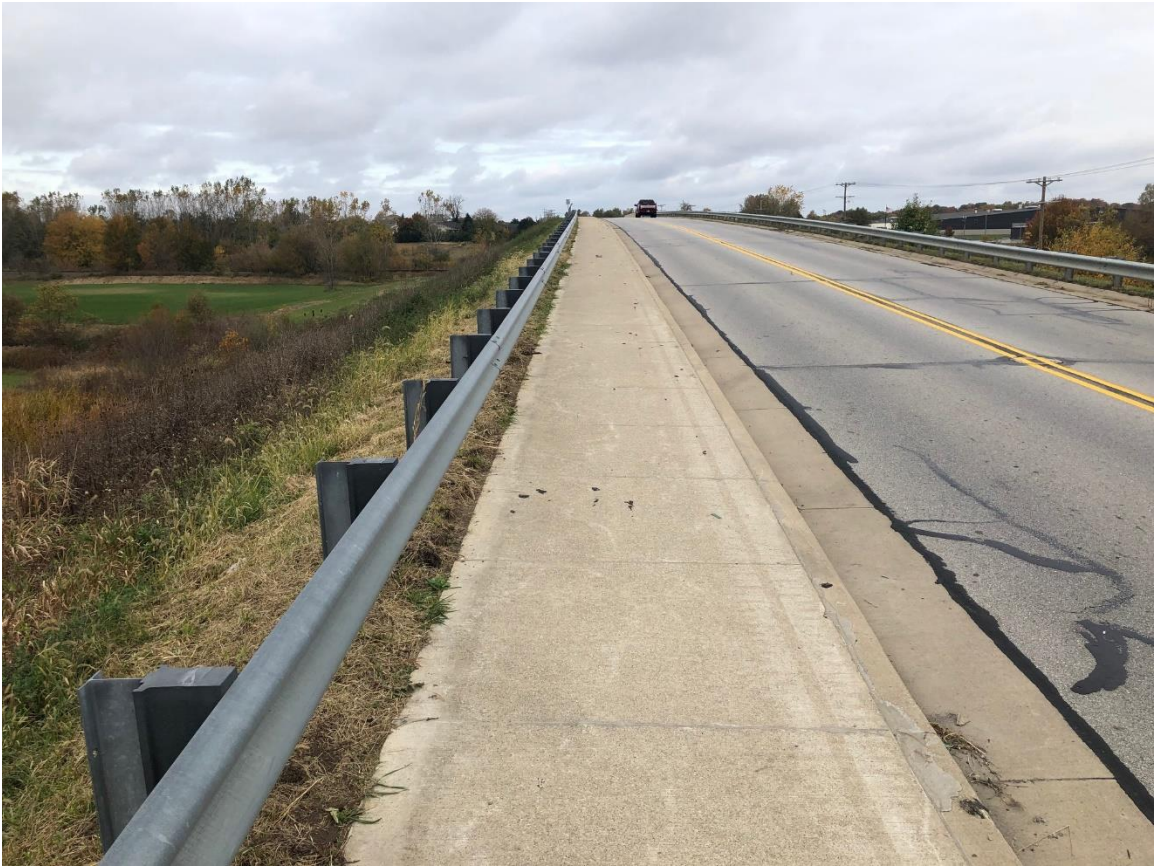
CR 1000 East at Complex Entrance looking north