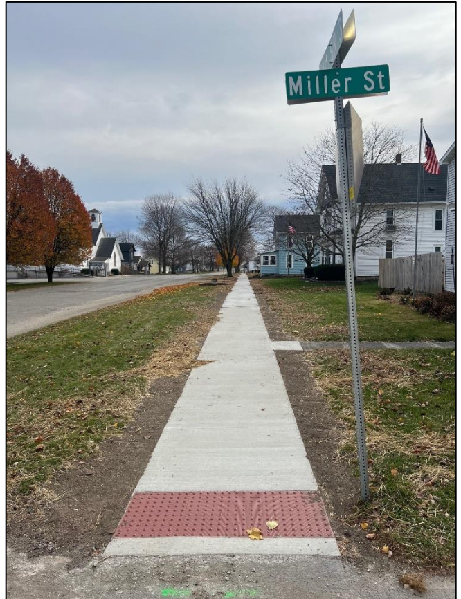
Miller Street (Section 12 to 13 Transition)