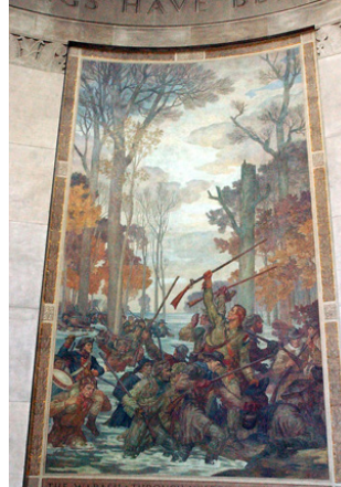
The Wabash: Through Wilderness & Flood