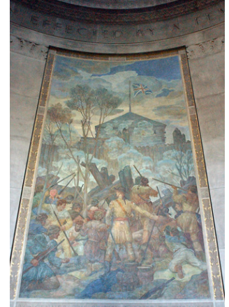
Vincennes: The British Barrier to the West