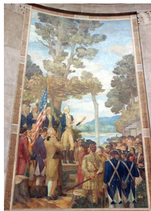
Marietta: The Northwest, a New Territory