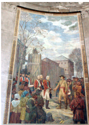
Fort Sackville: Britain Yields Possession