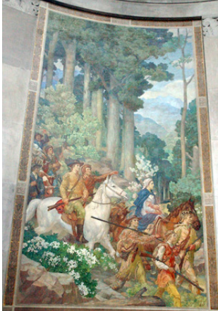
Kentucky: Entering the Great Valley

On the walls of the memorial rotunda, seven murals depict the Clark expedition story. The murals, which are oil on canvas, stand 28 feet tall and 16 feet long and took artist Ezra Winter and six assistants two years to complete them.