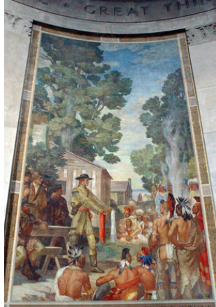
Cahokia: Peace or War with Indians