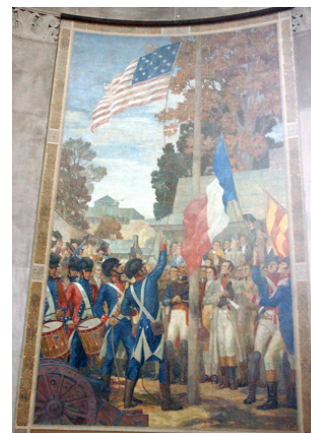
St. Louis: The Way Opened to the Pacific