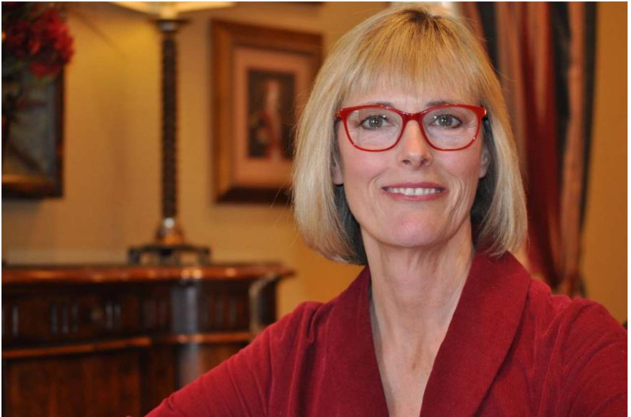
SUZANNE CROUCH AUDITOR OF STATE