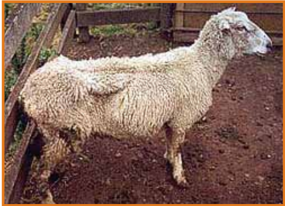
A sheep showing symptoms of Johne's disease.

Since the signs of Johne's disease are similar to those for several other diseases—parasitism, dental disease and caseous lymphadenitis (CLA), laboratory tests are needed to confirm a diagnosis.